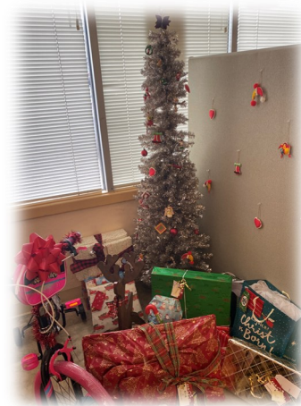
Gifts from Hamakua Baptist for East Hawai'i